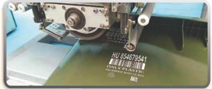
Variable data printing – Codes and progressive numbers.