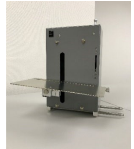
Opt. Power Restacker