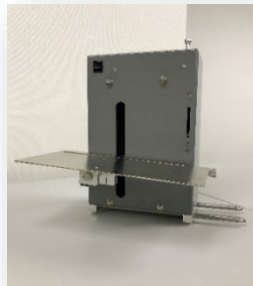
Opt. Power Restacker